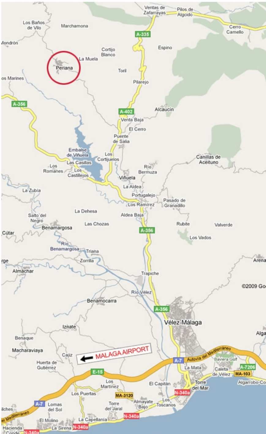
Large map showing location of Periana relative to Malaga