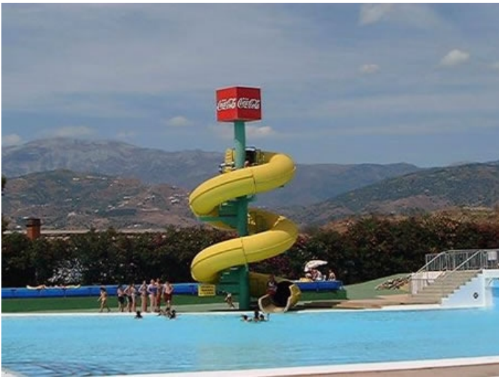
Children's park near Cantueso

The park is open 7 days a week from mid June to Mid September Opening Times : From 11:00 to 18:00 (19:00 during July & August) Prices: Children 4 to 12 yrs from 13.50€ Children under 4 free. Adults: from 18.50€ The prices vary by 50 cents according to the month.