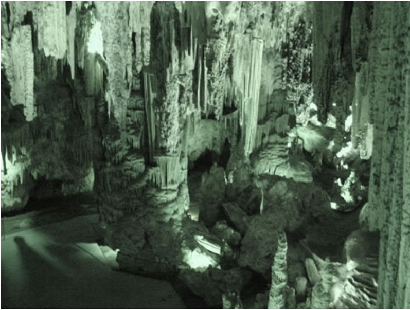
Famous Nerja caves

The caves were discovered in 1959 by a group of cavers, who entered through a narrow sink hole, known as “La Mina”. This forms one of the two natural entrances to the cave system. A third entrance was created in 1960 to allow easy access for tourists. The cave is divided into two main parts known as Nerja I and Nerja II. Nerja I includes the Show Galleries which are open to the public, with relatively easy access via a flight of stairs and concreted pathways to allow tourists to move about in the cavern without difficulty. Nerja II, which is not open to the public comprises the Upper Gallery discovered in 1960 and the New Gallery discovered in 1969.