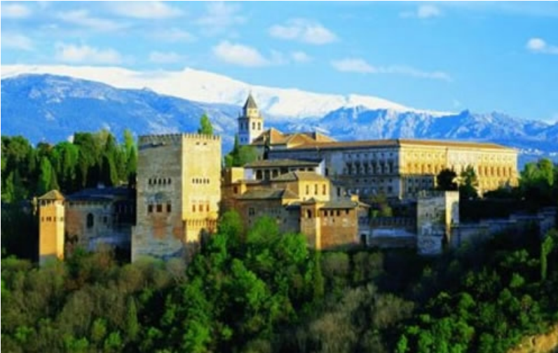
The Alhambra Palace