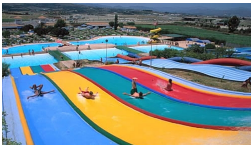
Water Park near Periana

Aquavelis water park: is open May to September and is situated 25 minutes away near the large supermarkets in the El Ingenio shopping complex in Torre del Mar. (alongside the A7 motorway).