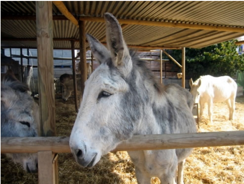
Donkey sanctuary in Nerja

Nerja Donkey Sanctuary: A donkey sanctuary in Spain, run by volunteers and funded entirely by donations. They are open to visitors 365 days a year. Dedicated to the care and welfare of donkeys.