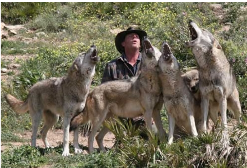
Wolf Park near Periana

Lobo Park (Wolf Park) near Antequera is a private wolf park where you may look a wolf in the eye for the first time in your life. The park has 4 different wolf sub-species (Canadian Timber, European, Alaskan Tundra and native Iberian wolves). The 40-hectares protected and untouched nature park has innumerable rare plant and animal species. Unlike other parks the wolves are socialized but NOT domesticated and live in a semi-natural environment.